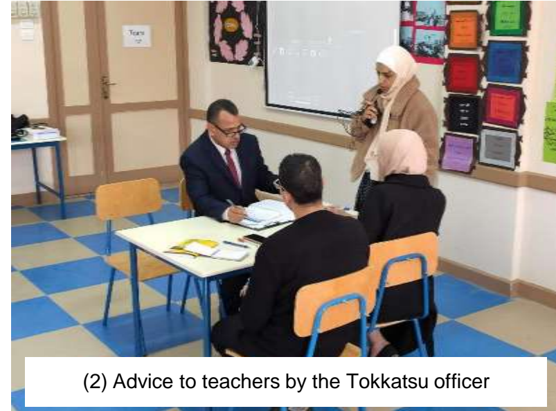
(2) Advice to teachers by the Tokkatsu officer