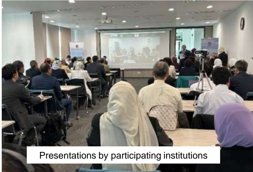
Presentations by participating institutions