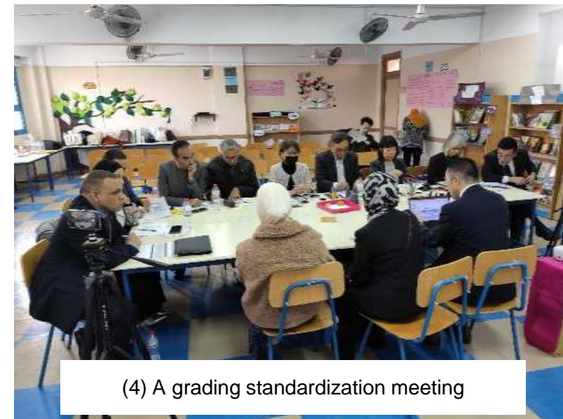
(4) A grading standardization meeting