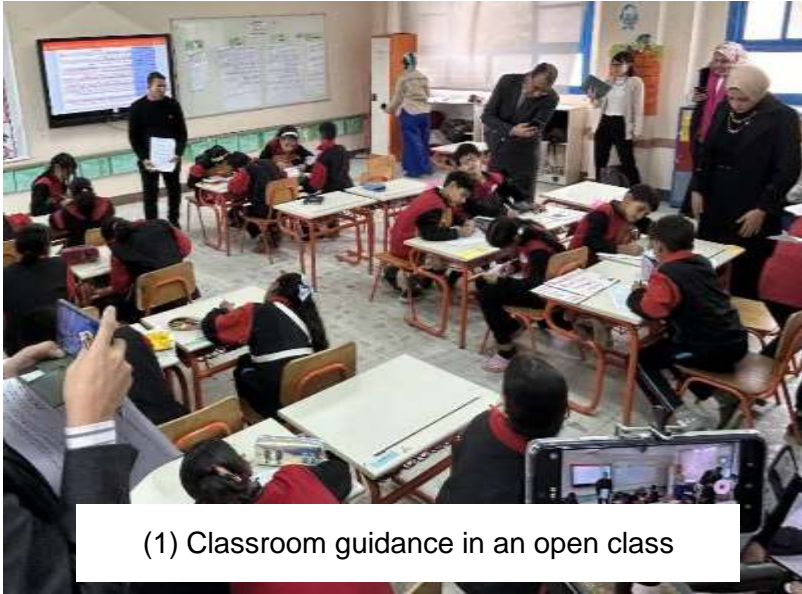
(1) Classroom guidance in an open class