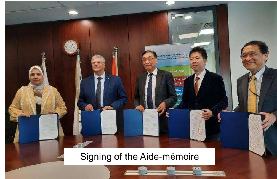
Signing of the Aide-mémoire