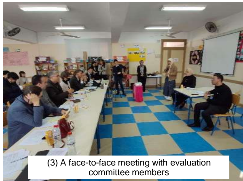
(3) A face-to-face meeting with evaluation committee members