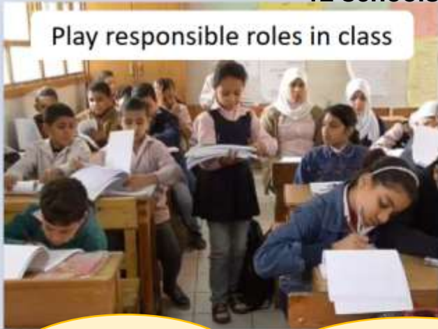
Pioneer Schools 12 schools